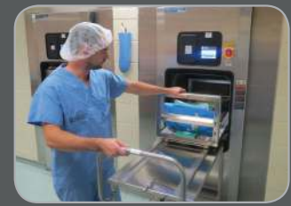
Autoclave Equipment Sterilizer

Finally, thank you to everyone who came together this year to help our hospital advance the delivery of outstanding health care. It is very rewarding for me to be part of the Foundation, supporting its mission, and I invite you to become involved!