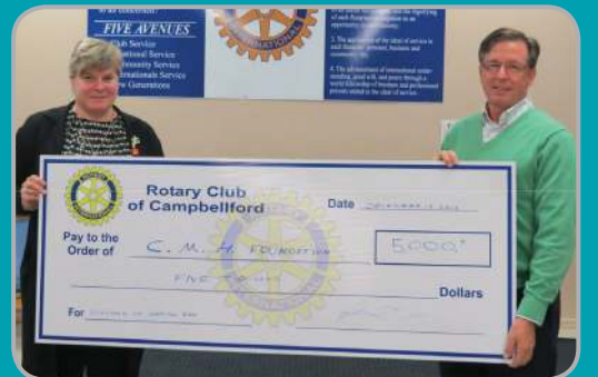
Rotary Club of Campbellford