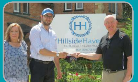
Hillside Haven Retirement Residence