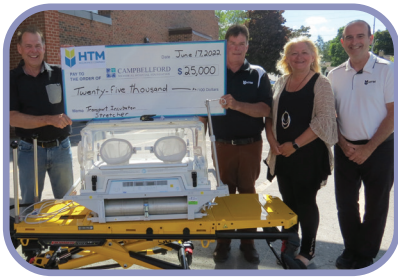
HTM Insurance Company Donation Presentation